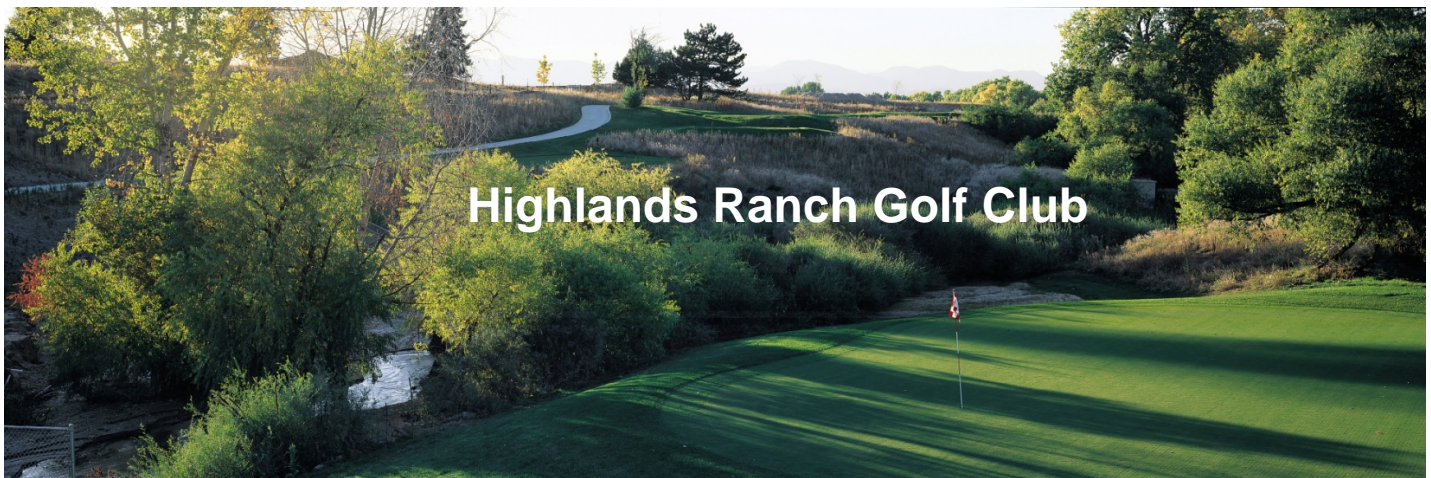
Highlands Ranch Golf Club